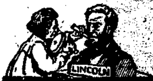
ABRAHAM LINCOLN He served his country well Service is our Watchword.