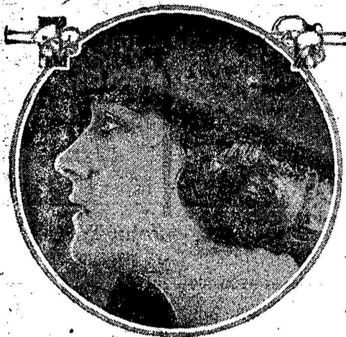
Gloria Swanson in the Paramount Picture "THE GREAT MOMENT"

MONDAY — Neal Hart, — "Tangled Trails." Episode Three, "Winners of the West." TUESDAY — Conway Tearle, — "After Midnight." Fox News and Harold Lloyd Comedy. WEDNESDAY — Wanda Hawley, "Her sturdy oak." Comedy, "A Family Affair." THURSDAY — Gladys Walton, "Playing with Fire." Episode No. 10, "Hurricane Hutch." FRIDAY Special — Gloria Swanson, "The Great Moment."