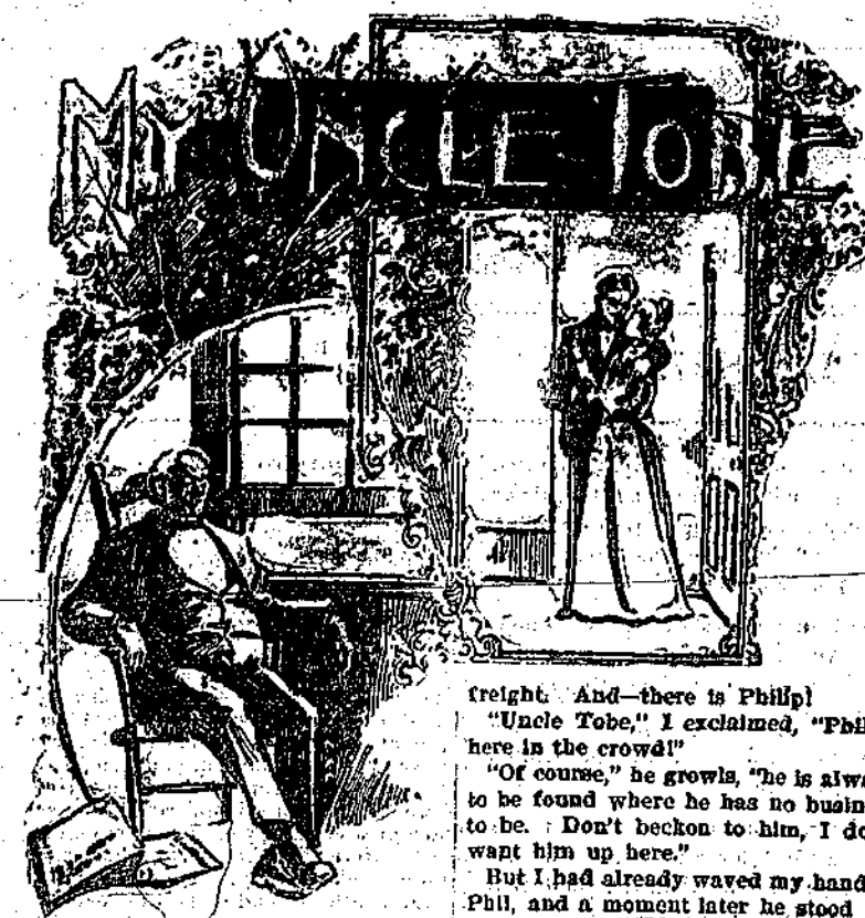
And—there is Philip! "I'm here," he exclaimed, "Phil is here in the crowd."

"Of course," he growls, "he is always to be found where he has no business to be. Don't beckon to him, I don't want him up here."